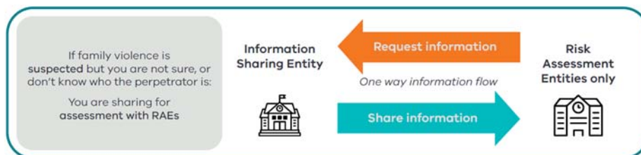
Figure 1: Overview of activities when sharing information for risk assessment

Family violence risk assessment is an ongoing process and is required at different points in time from different service perspectives. Education and care services will have a role in working collaboratively with other services to contribute to ongoing risk assessment and management of family violence.